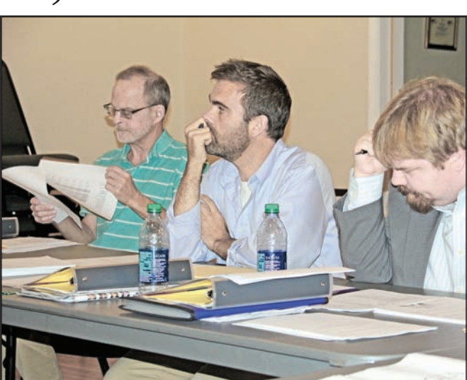
Young Harris City Council will set the yearly millage rate at the Oct. 4 regular council meeting.